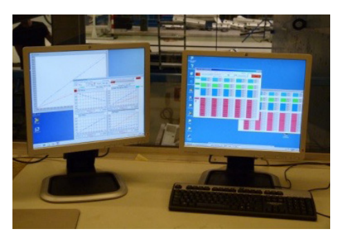
Acquisition graphical interfaces

From thoroughly analysis of your computational lab challenges to meaningful e-solutions