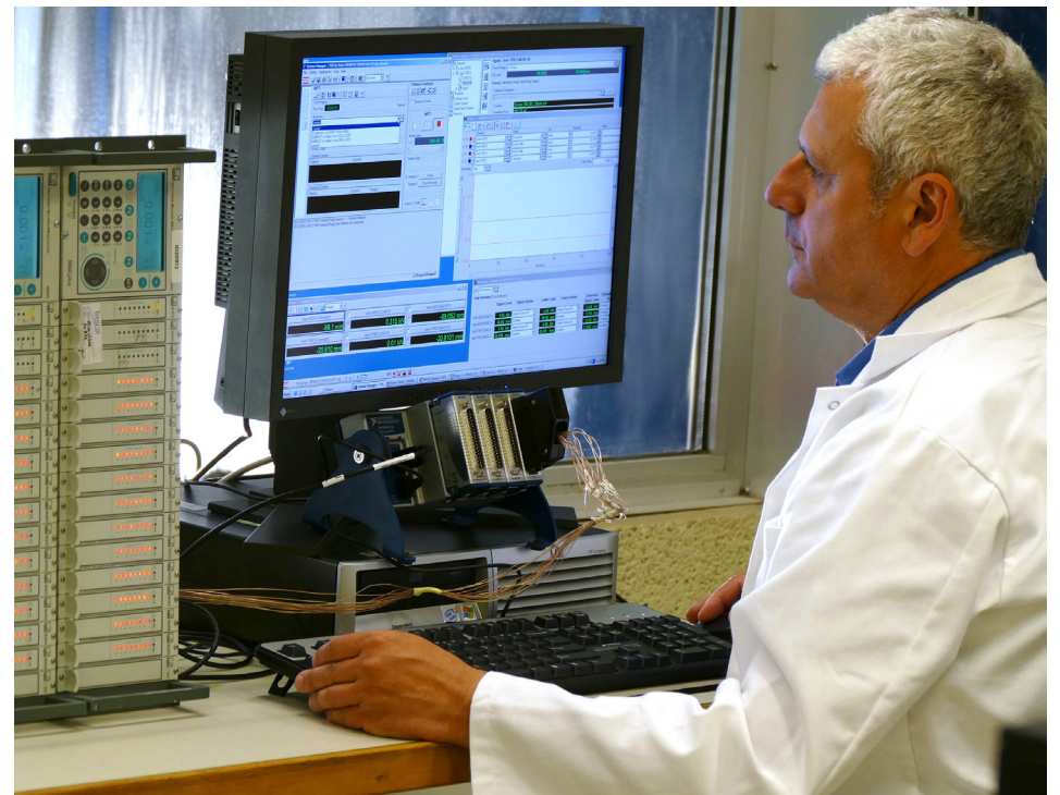
Validation of a RT software